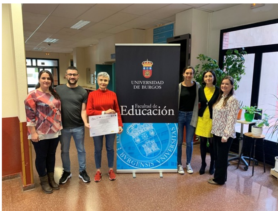
The Universidad de Burgos, coordinator of botSTEM project, shows the competition diploma

The botSTEM project received an honorable mention for its educational manual on Robotics and STEM education for children and primary schools in the category Science teaching materials in interactive and non-interactive support.